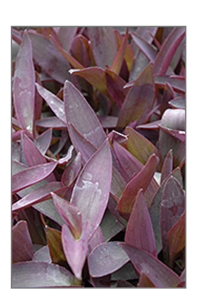
Purple Heart foliage

There are many factors that will affect the ultimate height, spread and overall performance of a plant when grown indoors; among them, the size of the pot it's growing in, the amount of light it receives, watering frequency, the pruning regimen and repotting schedule. Use the information described here as a guideline only; individual performance can and will vary. Please contact the store to speak with one of our experts if you are interested in further details concerning recommendations on pot size, watering, pruning, repotting, etc.