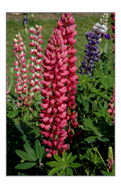
My Castle Lupine flowers

A standout, tall hybrid producing thick spikes of eye catching brick red flowers; a tremendous visual impact when massed in the garden, in border plantings or containers