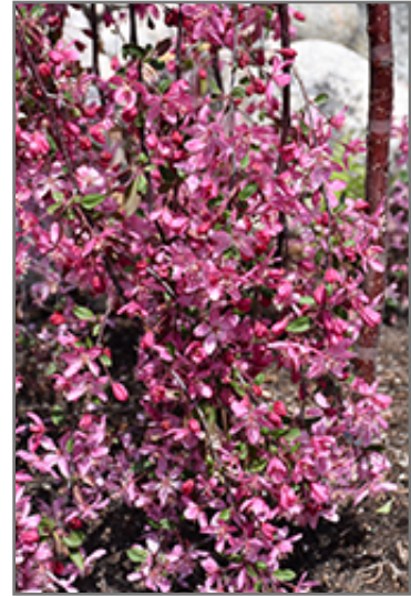
Royal Beauty Flowering Crab flowers