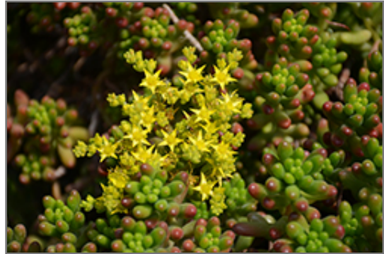
Jelly Bean Plant flowers

Jelly Bean Plant is a fine choice for the garden, but it is also a good selection for planting in outdoor pots and containers. Because of its spreading habit of growth, it is ideally suited for use as a 'spiller' in the 'spiller-thriller-filler' container combination; plant it near the edges where it can spill gracefully over the pot. Note that when growing plants in outdoor containers and baskets, they may require more frequent waterings than they would in the yard or garden.