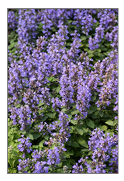
Purrsian Blue Catmint flowers

Purrsian Blue Catmint is recommended for the following landscape applications;