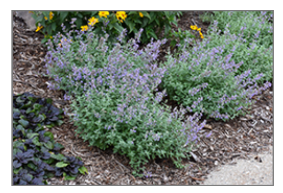
Purrsian Blue Catmint in bloom