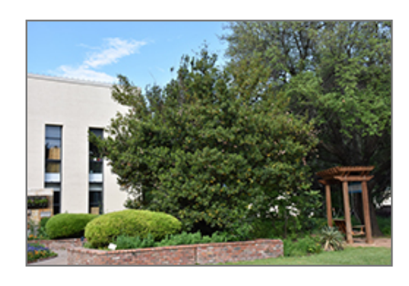
Bay Laurel

This is a relatively low maintenance tree, and can be pruned at anytime. It is a good choice for attracting bees and butterflies to your yard, but is not particularly attractive to deer who tend to leave it alone in favor of tastier treats. It has no significant negative characteristics.