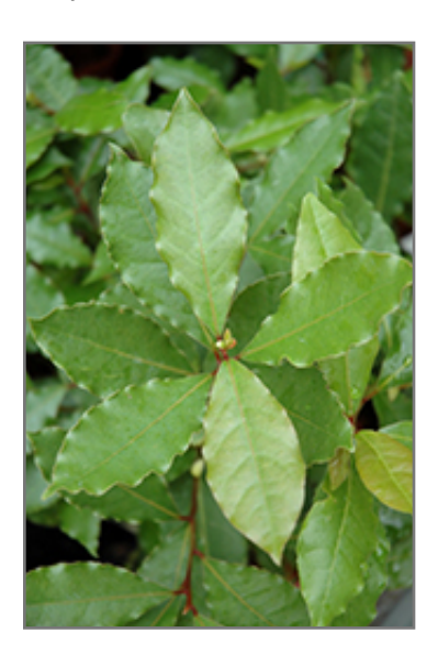
Bay Laurel foliage