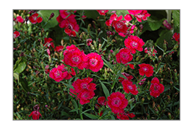
Ideal Select Red Pinks flowers