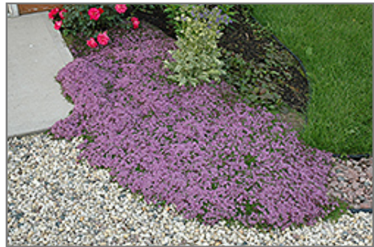
Creeping Thyme in bloom