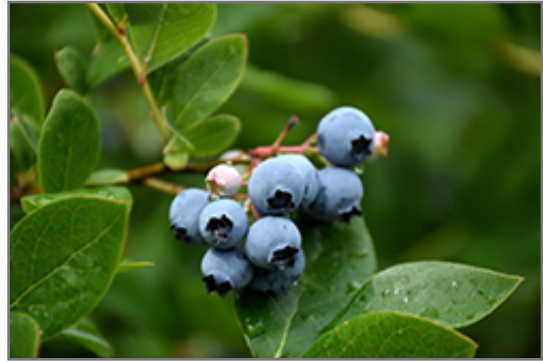
Northcountry Blueberry fruit

Northcountry Blueberry features dainty clusters of white bell-shaped flowers with shell pink overtones hanging below the branches in mid spring. It has green deciduous foliage. The glossy oval leaves turn an outstanding scarlet in the fall. It features an abundance of magnificent blue berries in mid summer.