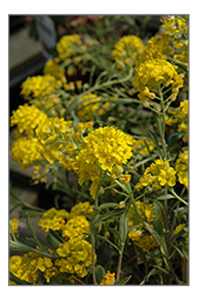
Alpine Alyssum flowers

This hardy variety is perfect for edging a sunny border or accenting a rock garden; yellow flower clusters appear above a mounded cushion of leaves in mid to late spring; evergreen in mild winter areas and drought tolerant once established