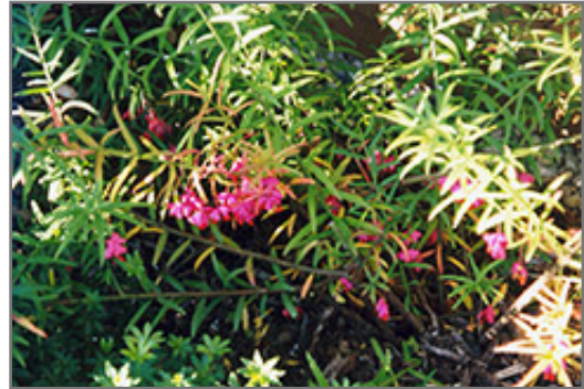
Turkestan Burning Bush flowers

This shrub performs well in both full sun and full shade. It is very adaptable to both dry and moist locations, and should do just fine under typical garden conditions. It is not particular as to soil type or pH. It is highly tolerant of urban pollution and will even thrive in inner city environments. This is a selected variety of a species not originally from North America.