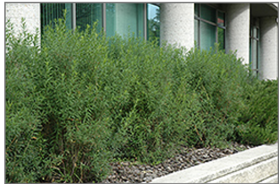
Turkestan Burning Bush