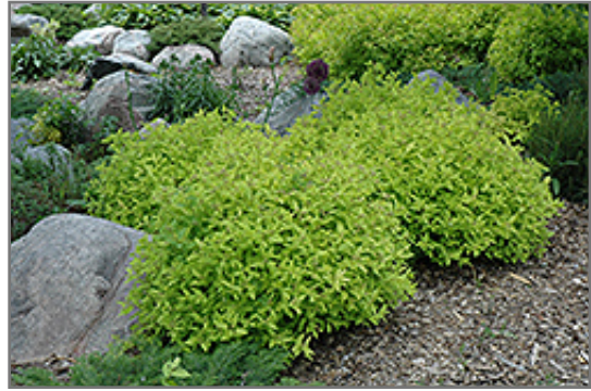
Goldmound Spirea