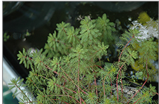
Red Stemmed Parrot Feather foliage