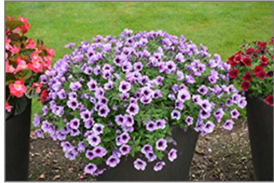
Supertunia Bordeaux Petunia in bloom

Supertunia Bordeaux Petunia is a fine choice for the garden, but it is also a good selection for planting in outdoor containers and hanging baskets. Because of its trailing habit of growth, it is ideally suited for use as a 'spiller' in the 'spiller-thriller-filler' container combination; plant it near the edges where it can spill gracefully over the pot. Note that when growing plants in outdoor containers and baskets, they may require more frequent waterings than they would in the yard or garden.