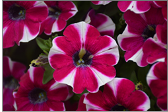
Cascadias Bicolor Cabernet Petunia flowers