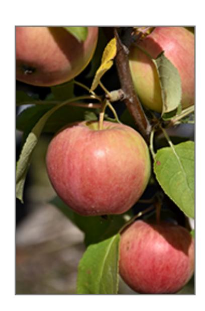
Gemini Apple fruit

This is a deciduous tree with an upright spreading habit of growth. Its average texture blends into the landscape, but can be balanced by one or two finer or coarser trees or shrubs for an effective composition. This is a high maintenance plant that will require regular care and upkeep, and is best pruned in late winter once the threat of extreme cold has passed. Gardeners should be aware of the following characteristic(s) that may warrant special consideration;