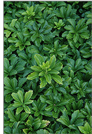
Green Sheen Japanese Spurge foliage