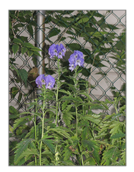
Autumn Monkshood in bloom

Autumn Monkshood is recommended for the following landscape applications;