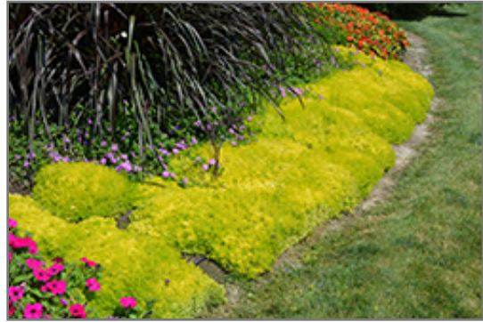
Lemon Coral Stonecrop

This plant is not reliably hardy in our region, and certain restrictions may apply; contact the store for more information.